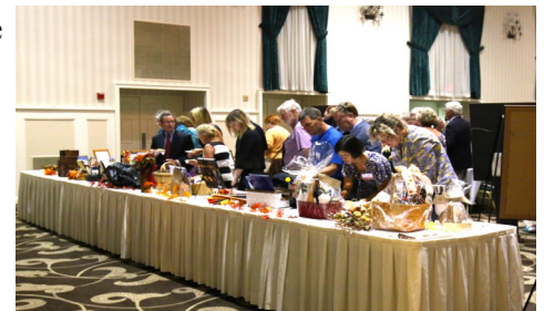
Silent Auction table. The Silent Auction raised just over $2,500!

We had a wonderful evening, thanks to Friends like you! We are already starting to plan next year’s Signature Event. Stay tuned for more info.